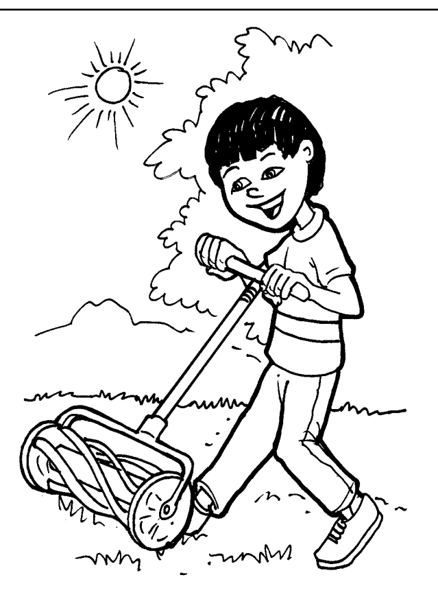
2 - buy